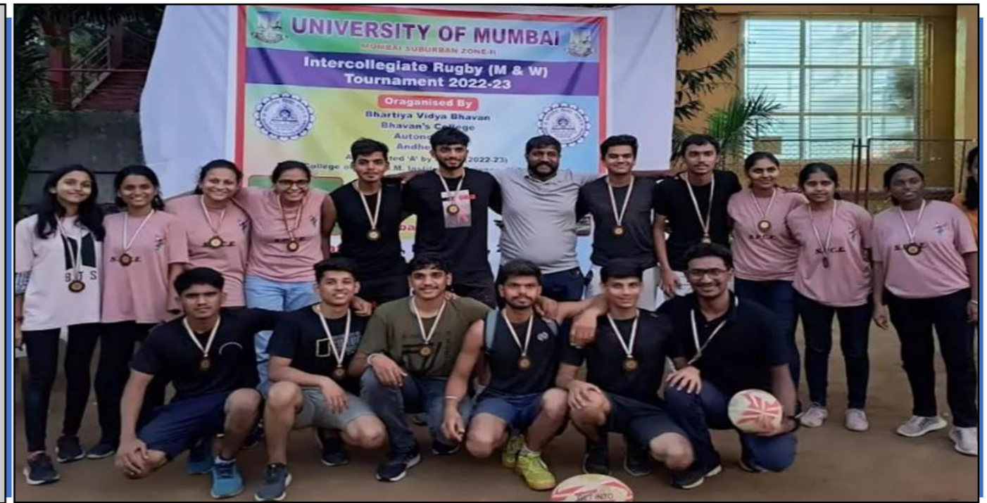
Intercollegiate Rugby Tournament , Mix Team (2022-23) Position : 3 rd Position