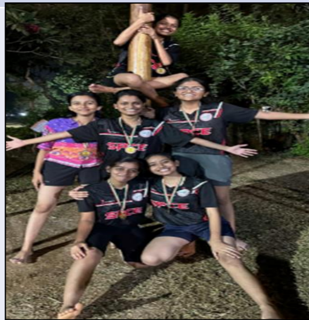
Girls Team: Malkhamb University Tournament (2023-24) Position: 3 rd in Mumbai University